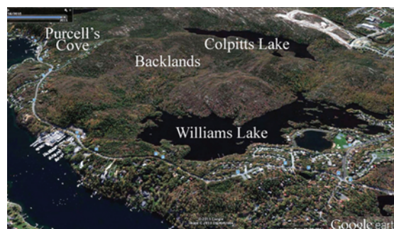
Google Earth Map of Williams Lake Watershed and Purcell's Cove Backlands (Hill and Patriquin, 2014)