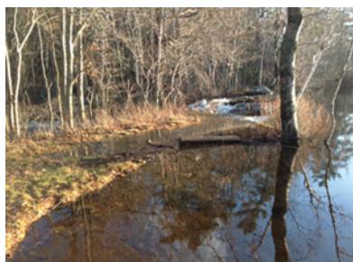
High water, Williams Lake dam, Dec 2015 - Photo courtesy of Kathleen Hall

A rough calculation shows that between 1940 to 1990 ice-out occurred 71% of the time in April; since then however 62% of the ice-out dates have been in March.