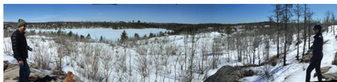
Williams Lake, winter 2015

The Board needs your input and also new members. Is your area represented on the Board? The WLCC depends on its volunteers. Please contact any of the Board listed at the end of this newsletter to volunteer or suggest a name. We encourage you to attend the AGM and look forward to seeing you on Wednesday, June 10th.