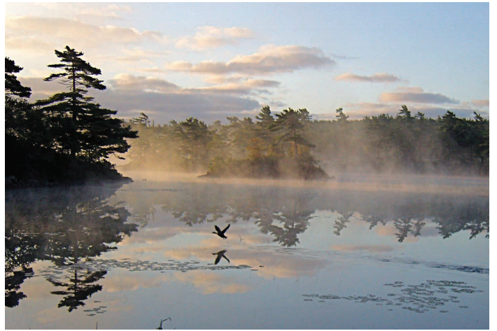
Bird reflection - Early morning Williams Lake