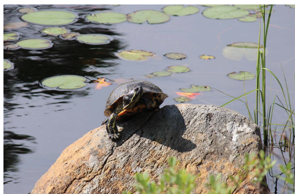
Painted turtle, Williams Lake - Photo courtesy of Leslie Randall

Although the Green Network Plan has not yet been finalized it is fair to say that Williams Lake and the Backlands have been recognized as a highly valued area in HRM.