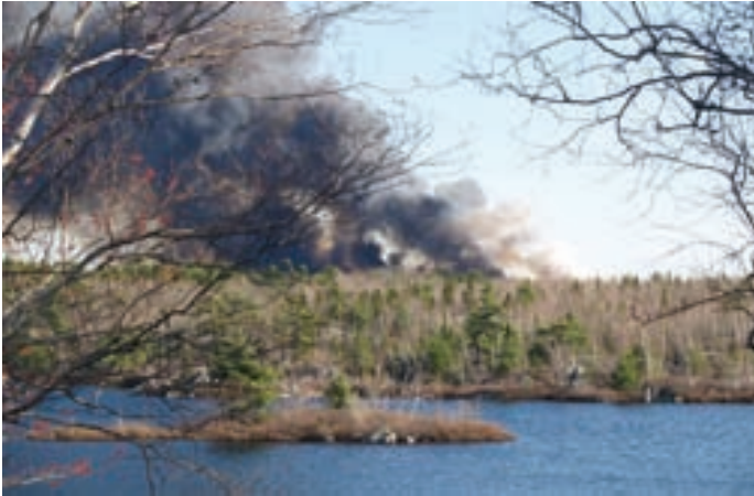
The York Redoubt fire as seen from Williams Lake.

One of the next steps in this regard is to take this work forward to the Department of Environment and other potential interested parties to see if we can move towards a final solution. It should be noted that currently none of the levels of government are showing any inclination or willingness to help share in the responsibility for this problem. We hope that this additional work will help further clarify the situation as we continue our efforts to resolve the dam and water level problems in Williams Lake.