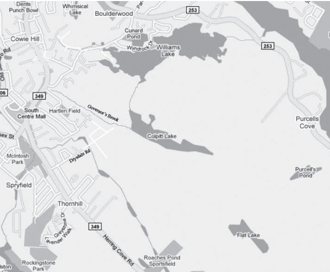
Colpitt / Williams Lake Area Map