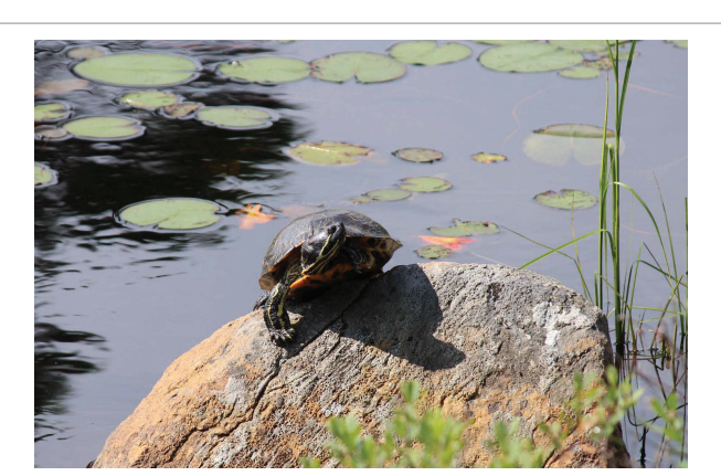
Painted turtle, Williams Lake

Although the Green Network Plan has not yet been finalized it is fair to say that Williams Lake and the Backlands have been recognized as a highly valued area in HRM.