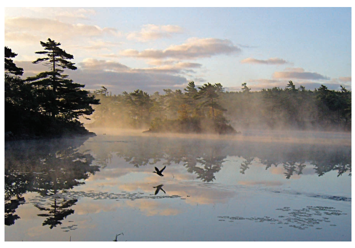
Bird reflection - Early morning Williams Lake