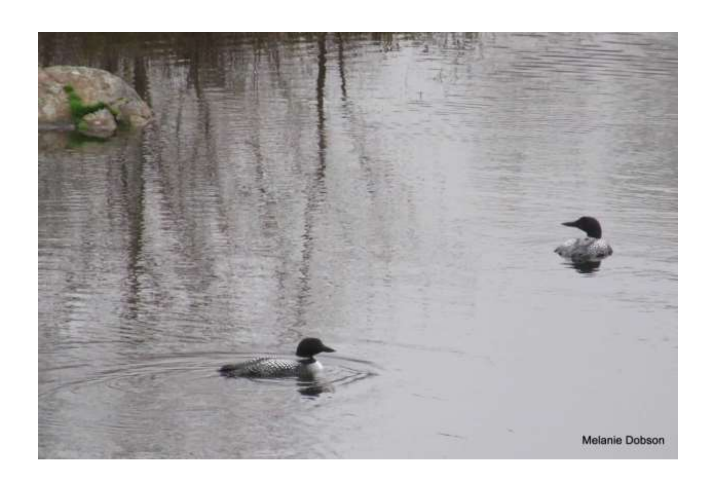
LOONS ON WILLIAMS LAKE