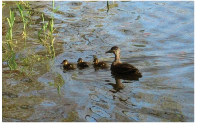
Spring Arrivals - May 21, 2018 Williams Lake

HRM made a pivotal positive decision in January, 2017 regarding the lake and the distribution of road salt (for a history of this issue and the HRM memo delineating the exact changes involved please see previous newsletters found on our website at www.williamslakecc.org ). The long-established practice of not applying road salt on streets close to the lake was reversed in early 2015 to the disappointment of the WLCC executive and many residents. After meetings between WLCC executive members and HRM staff along with continued pressure the policy was reversed to the status quo.