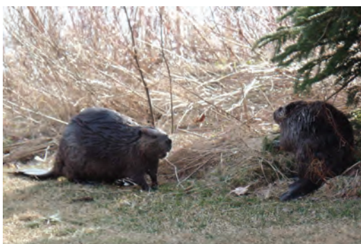
Williams Lake Beavers, Mar 29, 2018

A park entrance area and parking lot is planned for Purcell's Cove Road on lands currently owned by the Yacht Squadron, to be built by the Shaw Group. An accessible trail from the parking lot will lead to a gathering area at the east end of Williams Lake, where interpretive signage and benches will be located with a view of Williams Lake. Otherwise, not much will change: the area's existing trails will have signs and markers installed, and the trails themselves will remain narrow and natural. Year-round low-impact activities such as hiking, birding, interpretive walks and outdoor education will be permitted. Williams Lake and Colpitt Lake will both remain open for unsupervised swimming and non-motorized boating.