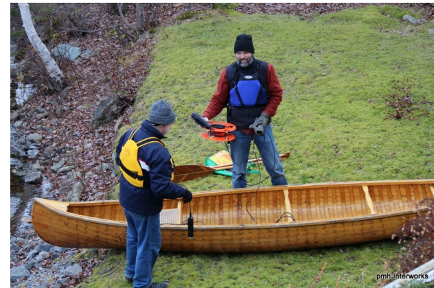
Water Testing, Williams Lake

The WLCC (Williams Lake Conservation Company) is a volunteer, non-profit community organization founded in 1968 in order to promote the health of Williams Lake and its watershed for the benefit of all. Everyone who shares the objectives of WLCC is welcome as a member.