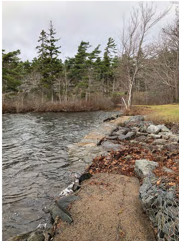
Water flowing just over the top of the dam - November 30, 2021