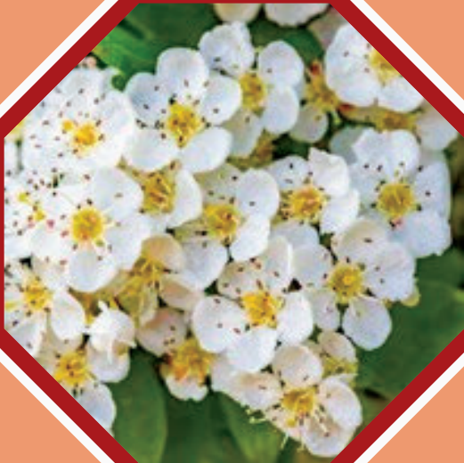
Multiflora Rose Rose multiflora